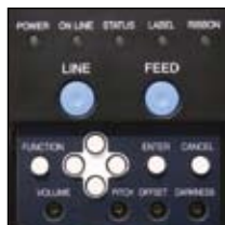
Multifunction buttons providing easy-to-navigate menu options