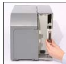
Tri-interface port for various connectivity