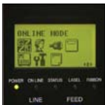
Large LCD display with graphical icons for user-friendly operation